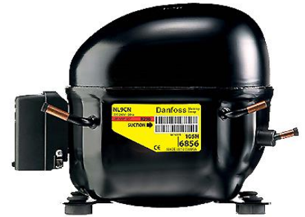
High-performance heavy duty compressor & condenser made in Europe