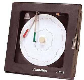
Optional 24 hours tracking, recording & printing system with password protection made in USA