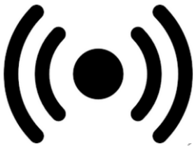
Multi system failure alarms with code display of the failure position