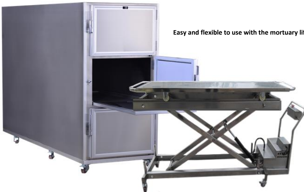
Easy and flexible to use with the mortuary lifter