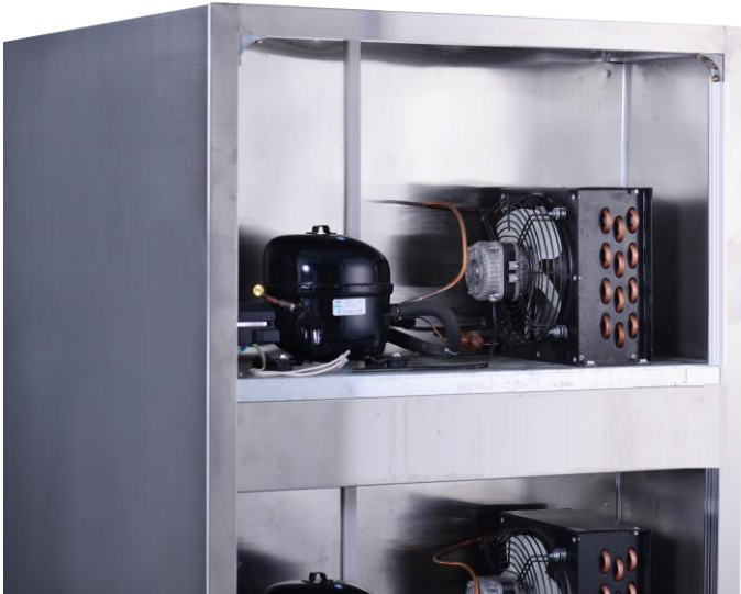
The refrigeration system of each chamber is individually controlled