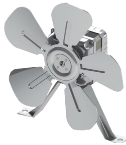
Top quality heat elimination fan made in Europe