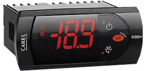
High accuracy computer controlled temperature system made in Italy