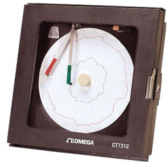
Optional 24 hours tracking, recording & printing system with password protection made in USA