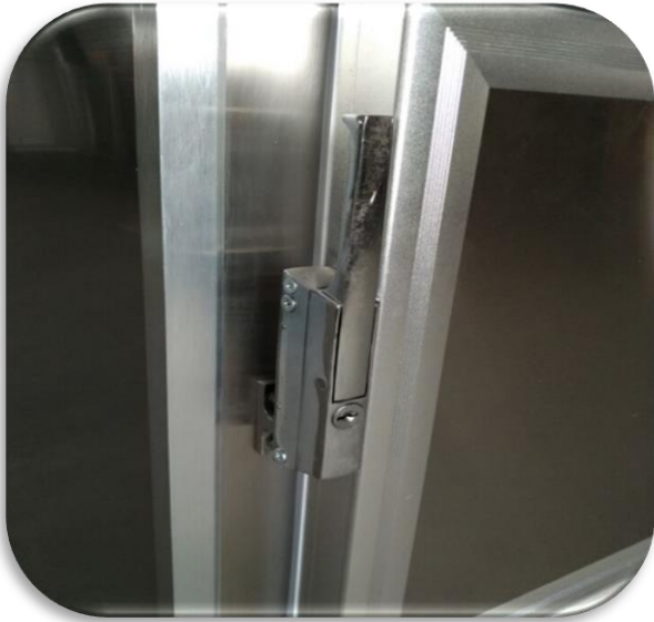
The safe door lock design can prevent missing-opening