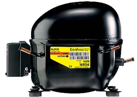
High-performance heavy duty compressor & condenser made in Europe